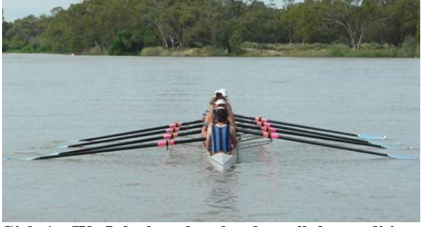
Girls 1st IV. It looks calm - hard to tell the conditions were so tricky

A BBQ was organised and due to some savvy shopping by Pip and great feast was enjoyed. Thanks to all who prepared and cooked the food, towed boats and assisted with the weekend.