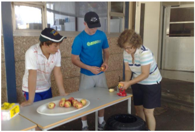
The apple slicer was a big hit