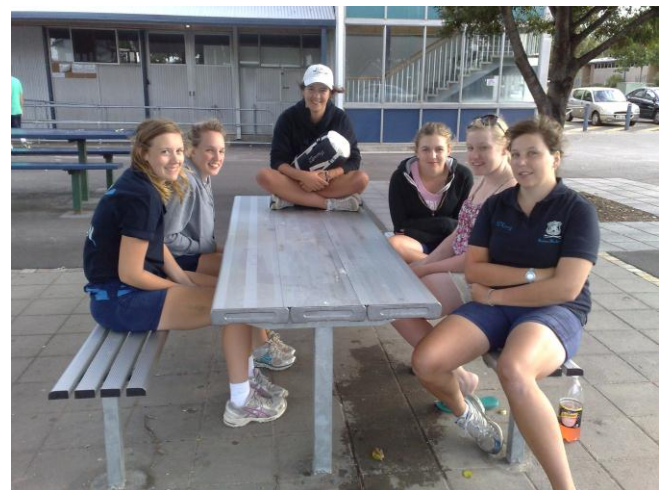
Relaxing at the end of Camp BBQ