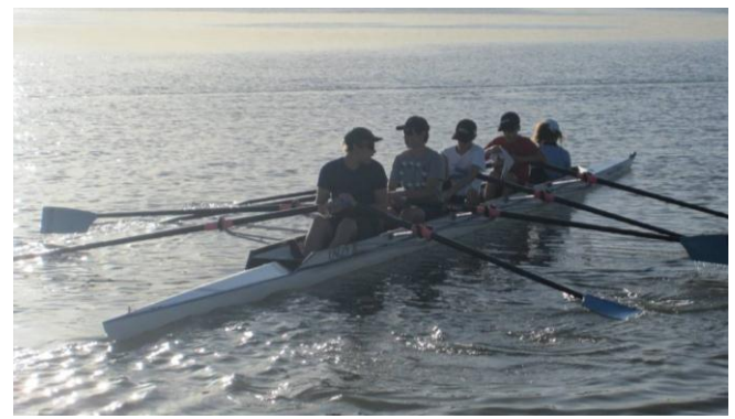
Early start for Year 10 Boys