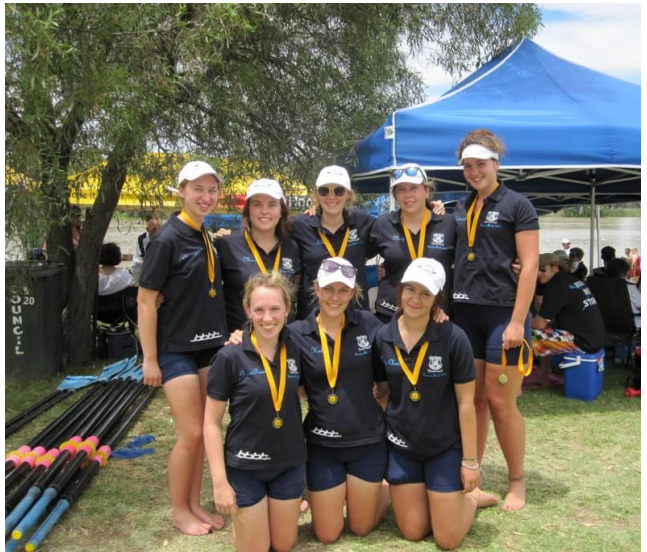
Senior girls and their medals from fours and quads at the Berri Regatta