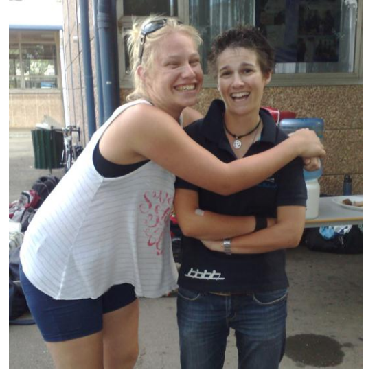
Relaxed Coaches after a busy week

Unley High School Rowing Club Newsletter