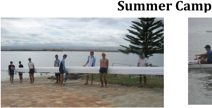
Senior Boys getting ready at the Port River