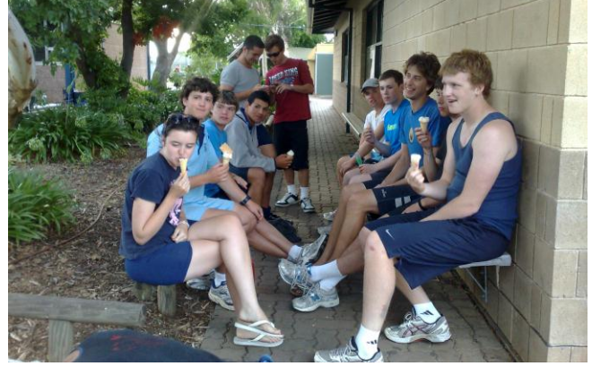
Well deserved icecreams