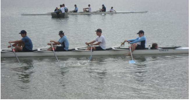
On the River