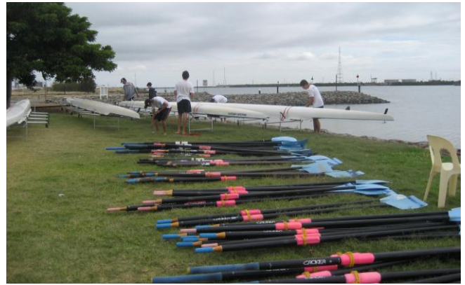
Rigging boats at the Port River