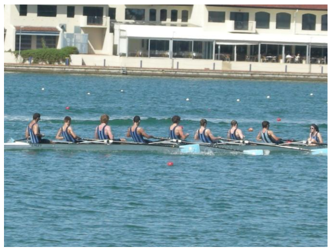
Senior Boys near the end of their race