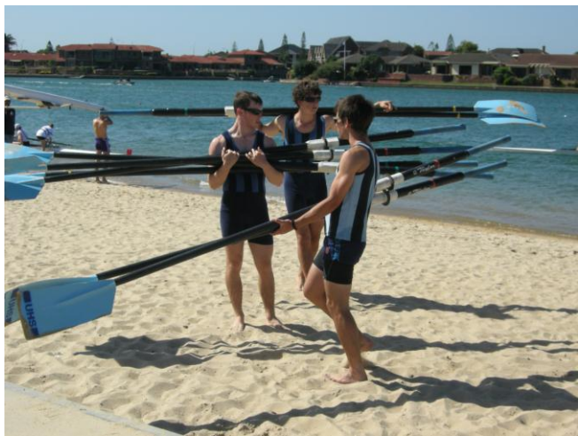
Helping out with the oars