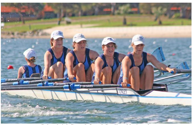
Schoolgirl Coxed Quad Scull at Nationals