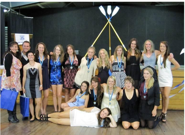
Senior Girls enjoying the night