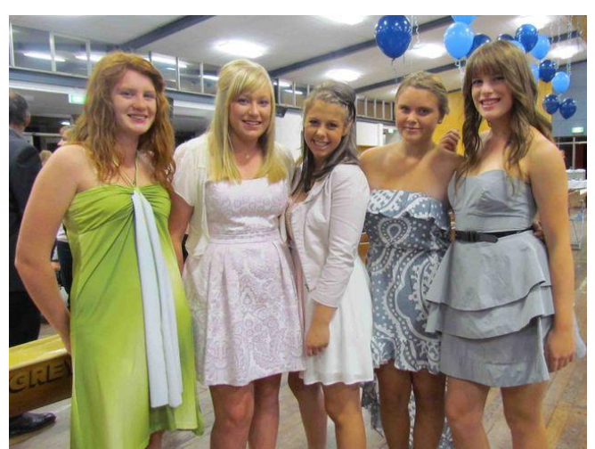
Year 10 Girls enjoying the night and looking good

So though we can celebrate the funding – and we should – we should also see this as a beginning. The committee is very excited about what else we can achieve and with all of us helping, we will achieve much in the near future.