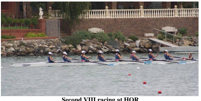
Second VIII racing at HOR