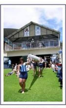
Unley High School Boatshed