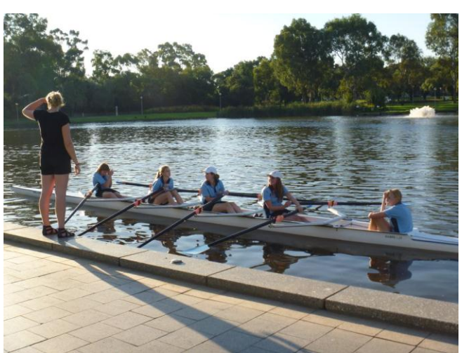
Year 8 Girls at Summer Camp