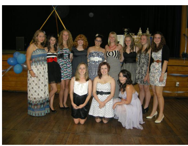
Our smiling Junior Girls