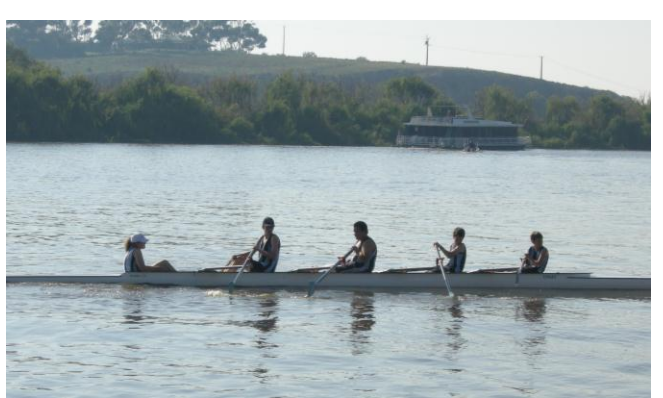
Year 9 Boys at Murray Bridge