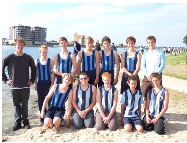
Year 10 Boys Squad