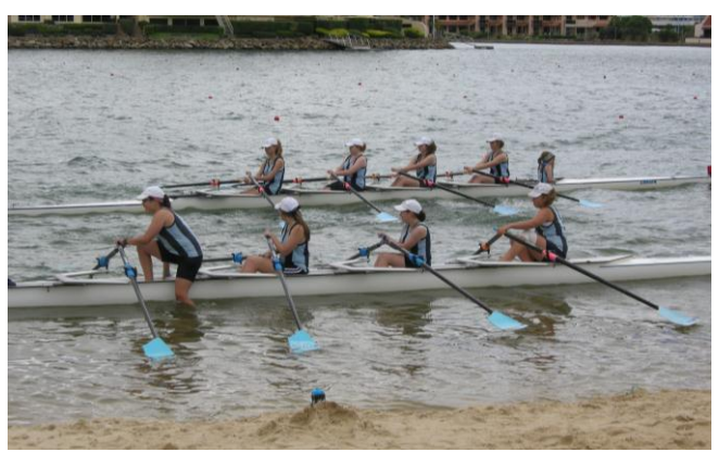
Both Junior Girls Crews heading out for their races

The Spring Camp at Ankara, Walker Flat, is scheduled from Friday, September 9 to Tuesday, September 13. In the weeks preceding this, regular trainings will resume.