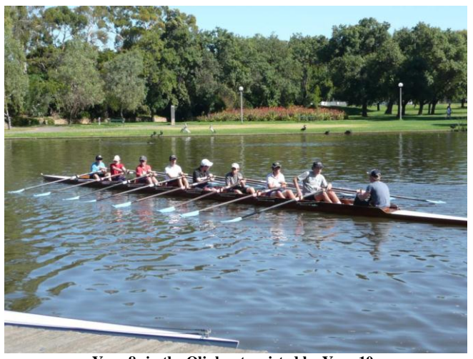
Year 8s in the Oliphant assisted by Year 10s