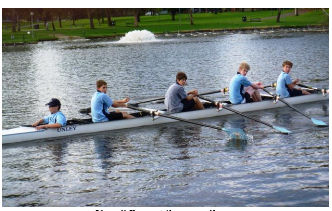
Year 8 Boys at Summer Camp