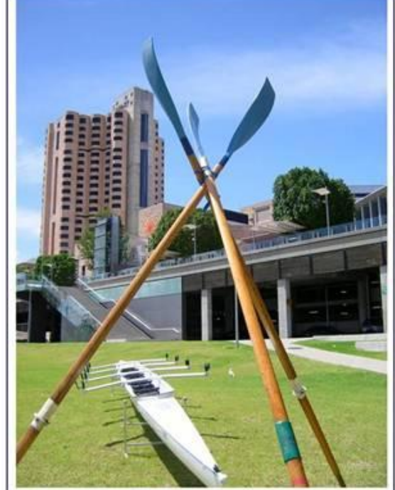
Naming ceremony for the "LOCK"