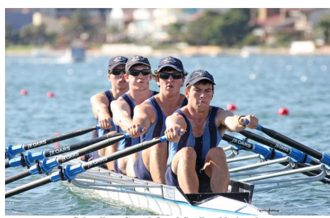
Schoolboy Coxed Quad Scull at Nationals