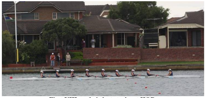
First VIII on their last stroke at HOR