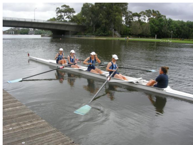
Senior girls heading off for their race