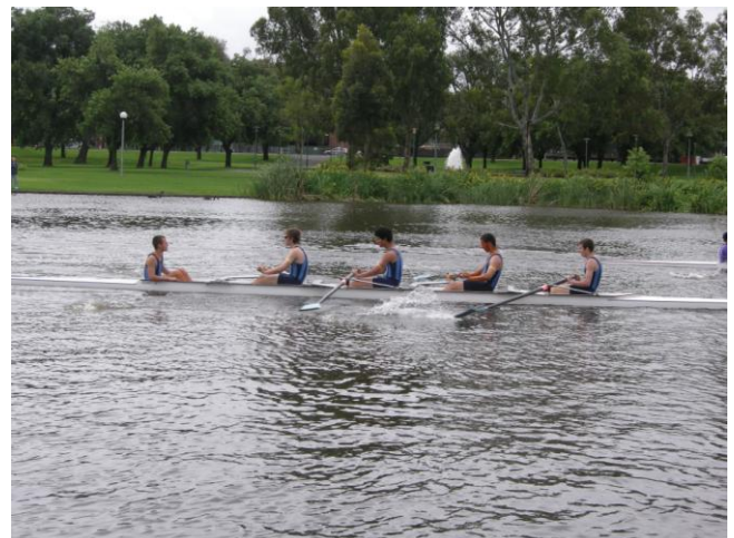
Senior Boys racing

A photo of the Club Captains will be in the next newsletter.