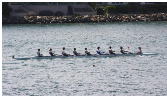
Boys First VIII in their first race of the season at West Lakes

All Rowers should wear caps at training, regattas and sometimes during a race. Pip Lundy has a supply of UHS Rowing uniforms for sale including caps ($15), polo tops ($36), T-shirts. The Committee is also ordering polo tops and dri-fit tops. These can be tried on at Regattas and ordered or purchased if in stock. We also have some UHS Rowing car stickers which were designed and sponsored by Dylan Lundy and cost $5.00 each. Please contact Pip on piplundy@aapt.net.au for more details.