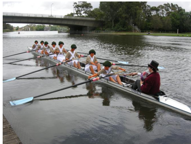
Willy Wonka and the Oompa-Loompas