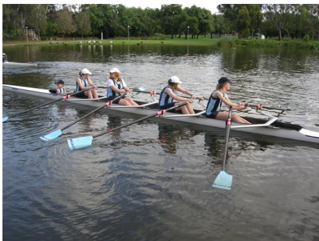
Junior girls heading off for

Parents – please take a look at page 13 of the Blue Book. A roster has been created to assist with the BBQs at Regattas. Parents of the same squad are rostered together so this is also an opportunity to meet other parents.