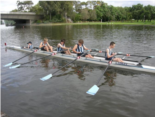
Junior boys heading off for their race

Emails will be sent soon requesting donations for prizes. Thank you!