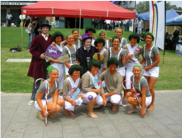
Willy Wonka and the Oompa-Loompas from Annesley AND UHS!

Did you know the results are often in the Sunday Mail sports section and also on Mondays you can view the results on the ROMS website -