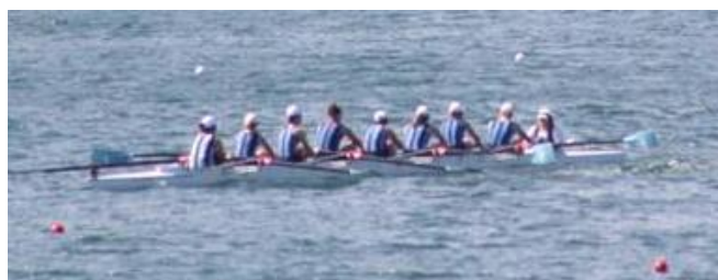
Girls First VIII in their first race of the season at West Lakes