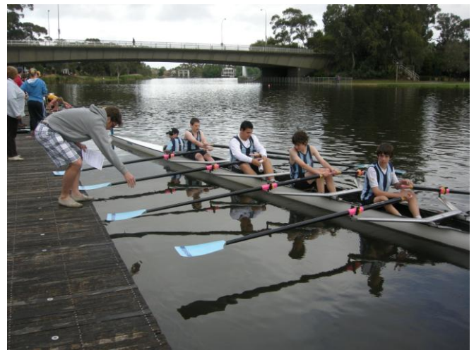
Junior boys heading off for their first race of the season

Also, usually the next Regatta's final Programme is available on the web by Thursday afternoon. Follow the previous instructions but click on the appropriate link under Latest Documents on the right hand side of the screen.