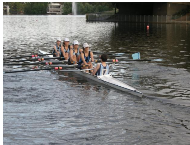
Junior girls heading off for their race

If your child needs a lift to a Regatta or home from training contact another parent. The blue book will have contact details so you will know who lives nearby but in the meantime contact your Squad Manager if you are unsure.