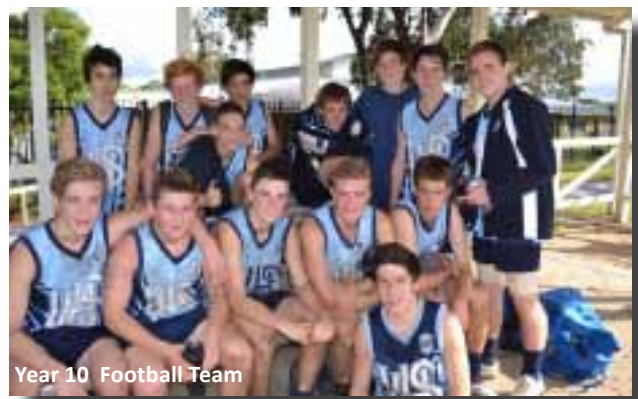
Year 10 Football Team

Welcome to term three! Our winter season is nearly at an end with our mid-week finals rounds being played in Week 4 and the Saturday morning competition finishing up on 18 August 2012. We have had a good season for these winter teams with lots of successful games over the two terms. Our Open Football boys are playing in the Grand Final against Concordia at Unley High School which will hopefully result in a win. We also have one of our Year 8/9 Netball teams playing in the Grand Final for their division which is exciting. Our other Netball teams have also done very well with two other teams playing for third place which is a great result.