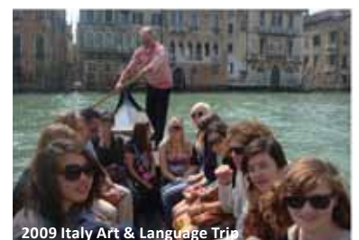
2009 Italy Art & Language Trip