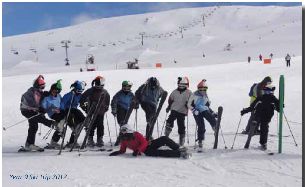
Year 9 Ski Trip 2012