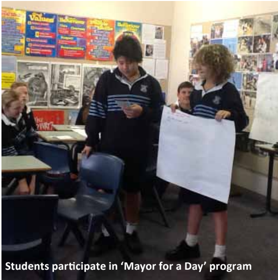
Students participate in 'Mayor for a Day' program

The City of Unley has been seeking ideas for their future planning to make living in the district more sustainable and fulfilling.