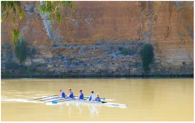
Year 9 Boys, Spring Camp