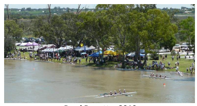
Berri Regatta, 2010

Unley Rowing Club will be participating at the Berri Regatta on Saturday 1<sup>st</sup> December and Sunday 2<sup>nd</sup> December. It is not a compulsory regatta for rowers, however the families that have attended in the past have found it to be a great social occasion. Cabin accommodation is still available at the Lake Bonney Caravan Park. The club has utilised this accommodation venue for the past 3-years. More information about the regatta will be sent to families closer to the date.