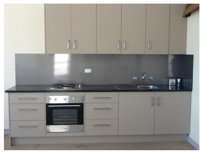
The new kitchen!

installing a new kitchen at the Torrens Boathouse. It is a big improvement on the previous facility.