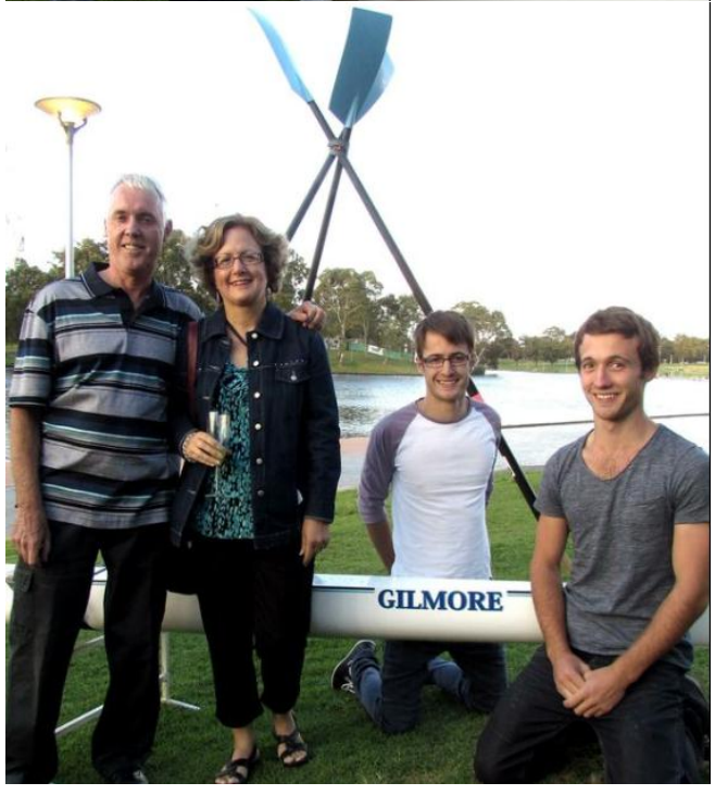
Unley High School Rowing Club Newsletter