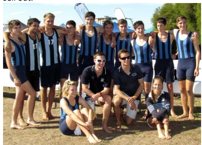
Senior Boys Squad

The beer glasses are still here! They look great and are perfect for entertaining or just for everyday use - six glasses for $45.00. Please contact Wendy James to make your purchase. Hurry before they sell out.