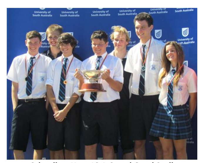
Schoolboy Year 10 A Coxed Quad Scull

Thank you to the HOR Sub-Committee who so wonderfully coordinated the tent set-up, and catering rosters, and also to the numerous families who assisted with these tasks or with decorating our site, cooking baked goods, or the packing up at the end of an exciting day.