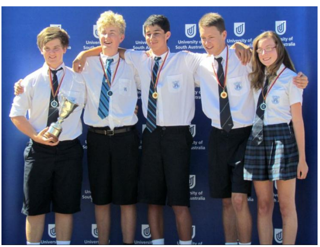
Schoolboy Year 9 A Coxed Quad Scull