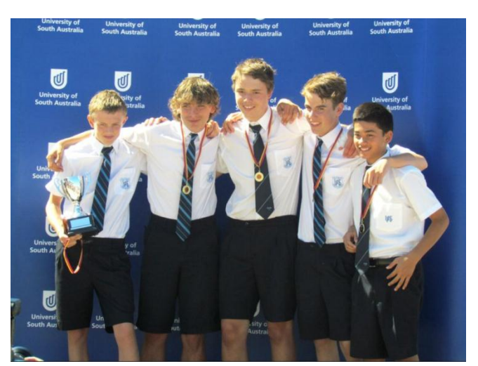
Schoolboy Year 9 A Coxed Quad Scull