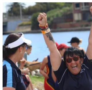
...and a very happy mum!