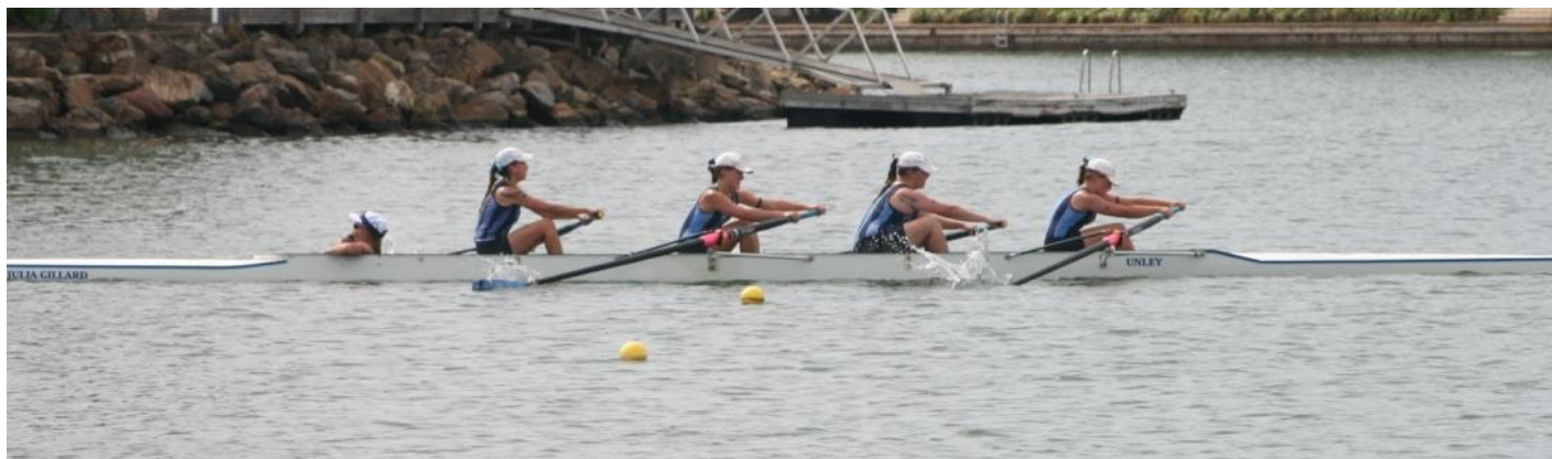
The Senior Girls Four well on their way to a win