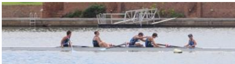
The Boys First Four all spent after finishing first...